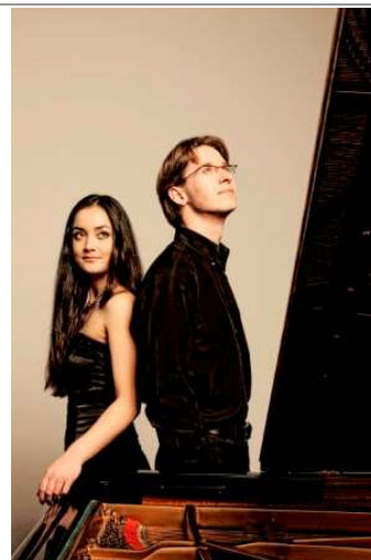
Pianoduo Scholtes/Janssens